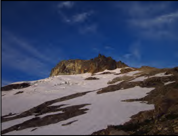
Sloan Peak with the formidable Sloan Glacier in the foreground

An Aug. 25-26 climb of Sloan Peak illustrated the amazing family nature of OSAT.