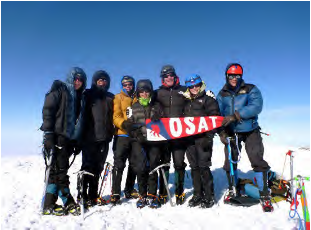
OSAT GCC Class of 2012—Mount Rainier Summit