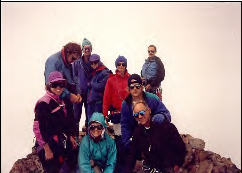
OSAT HISTORY:

The OSAT Echo is our email list. There have been some problems maintaining the list lately. We will try to assure the list is current with respect to wishes expressed on your web site membership profile, but this is not automated at this time, so please bear with us. To post a message: send email to