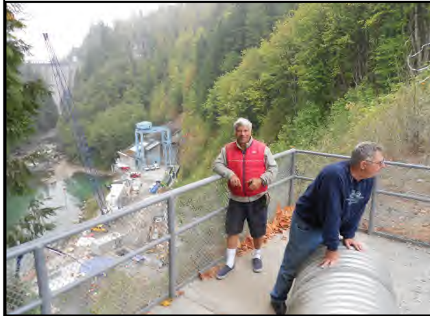
Anderson Lake trailhead.